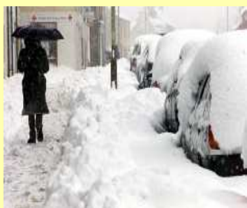
Last winter's heavy snow caused problems for motorists and pedestrians alike.

Winter transportation can mean ice, snow, and hazardous roads. Road conditions can change in an instant. Before travelling, give your car a quick checkover