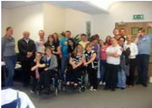
Delegates enjoying the 2011 Big Plan event

In the Big Plan, the use of person-centred planning tools allows each adult/young person to develop an action plan to achieve their goals and dreams. The Big Plan is spread over 6 sessions to allow plenty of time for development and for the focus person to invite people along who can help support them through the whole process.